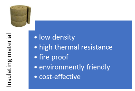
Figure 1. Characteristics of insulating materials

Thermal insulation material should have low density, high thermal resistance, cost-effective so it can conserve energy and lower the use of natural resources. Their benefits also include fire protection, decreasing noise levels, being environmentally friendly and being applicable in different fields. Thermal insulation materials are classified into four groups: organic, inorganic, combined and advanced materials. Inorganic materials such as glass wool and rock wool are the most available in the market, followed by organic ones such as polyurethane (PUR), polyisocyanurate (PIR), extruded polystyrene (XPS), expanded polystyrene (EPS). These insulation materials are the most favorable due to their low thermal conductivity and low cost.