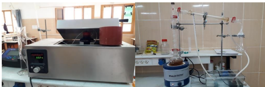
Figure 2. (a) Fermentation device, (b) distillation system.

For bioethanol production, 100 ml of inoculum are added for each obtained must. Concentrated sulfuric acid 96% (commercial solution) is added to reduce the pH from 6.23 to the favorable yeast level (4.3- 4.8). Once the desired pH is reached, they are transferred to 1L fermentors and anaerobically conducted for 72 hours at a temperature of 30 \pm 2 °C. After alcoholic fermentation, the substrate juices are separated by centrifugation. After that, the ethanol contained in the must is distilled at the temperature of 78.5 °C [3]. The device of the bioethanol production is presented in the figure 2.