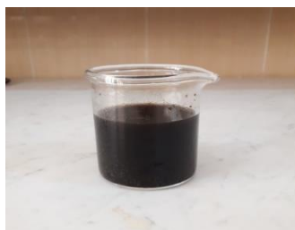
Figure 1. Juice of used substrate.

Commercial baker's yeast Saccharomyces cerevisiae was used for inoculation. Synthetic medium, which consisting 1 g of yeast is added to 100 ml of distilled water containing 12 g of sugar, with stirring for 60 min at 30 °C. For substrate juice preparation, two methods are applied, the 1 st method consists in separating the substrate cores using a mixer to obtain a must rich in substrate pulp and the 2 nd method used by M.A. Mazmanci [6] consists in extracting the maximum of reducing sugars substrate without pitting. For both methods, 200 g of substrate was placed in 1 L of tap water. After applying the two methods, a final concentration of 100 g/l (pulp/water) was used for the production of bioethanol. The obtained juice of substrate is shown at figure 1.