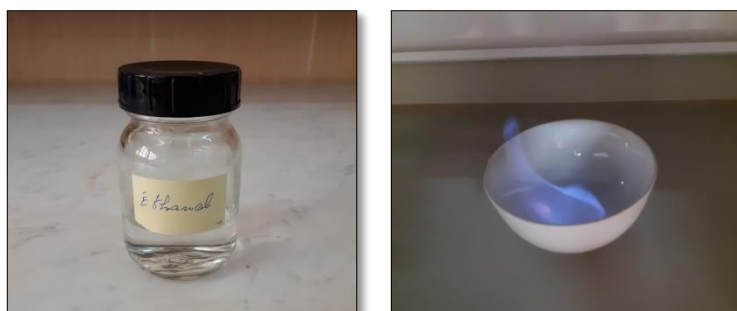
Figure 3. Flammability test of produced bioethanol.

For the flammability test of the produced bioethanol, using a small quantity (30ml) of bioethanol in a crucible and lit it with a matchstick gave a blue fire. So the flammability test is positive according to this result (Figure 3).